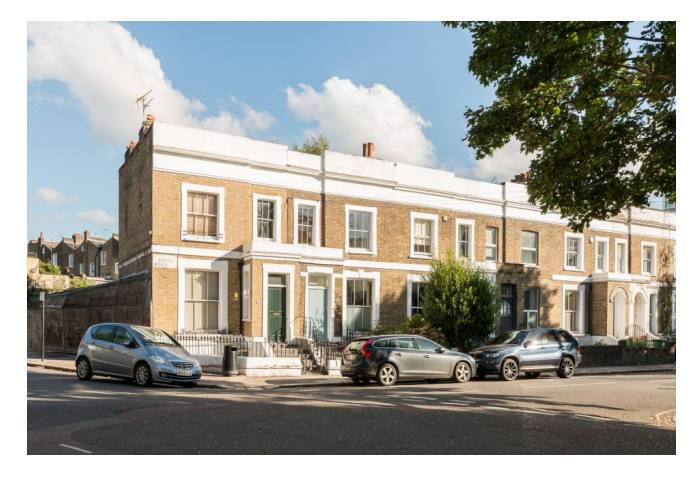
London, North London Sold