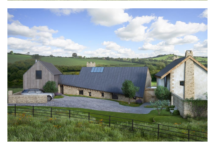
South-West England Sold