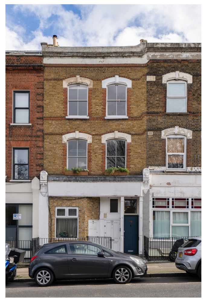
East London, London £725,000 Leasehold