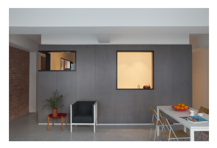
East London, London