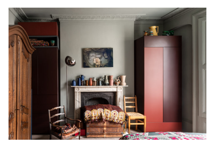
London, North London Sold