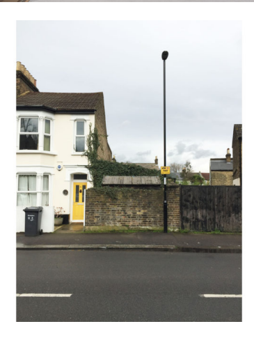
London, South London