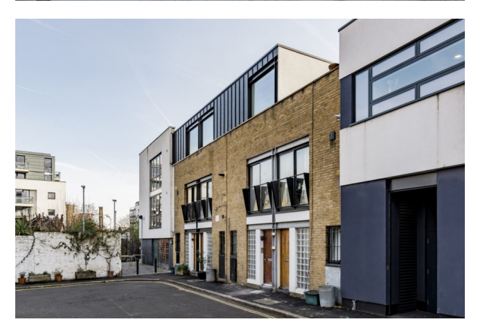
London, North London