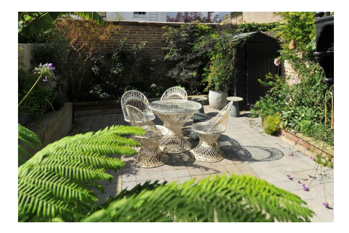
South-East England Sold