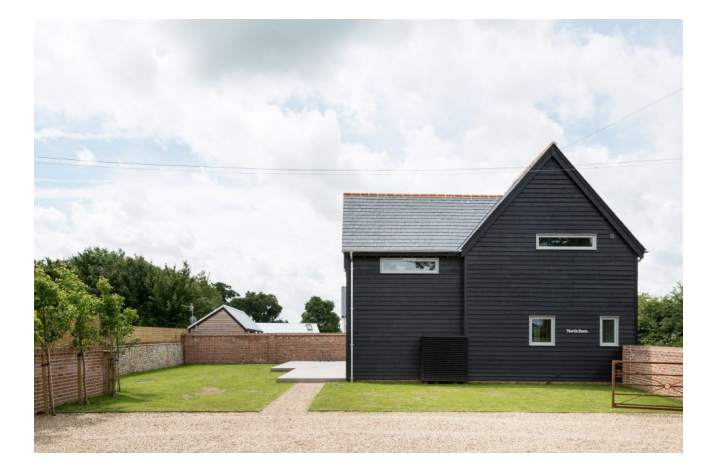
South-East England Sold