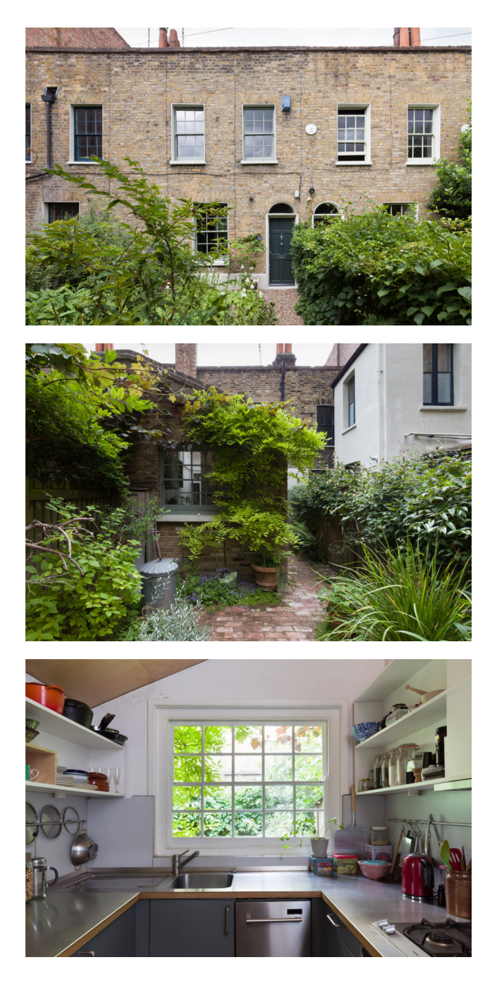
East London, London Sold