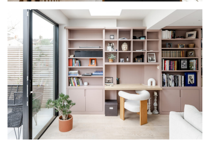
London, South London £1,555,000 Freehold