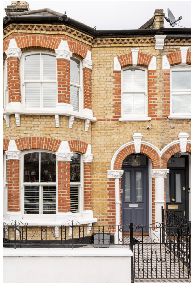
London, South London £1,555,000 Freehold