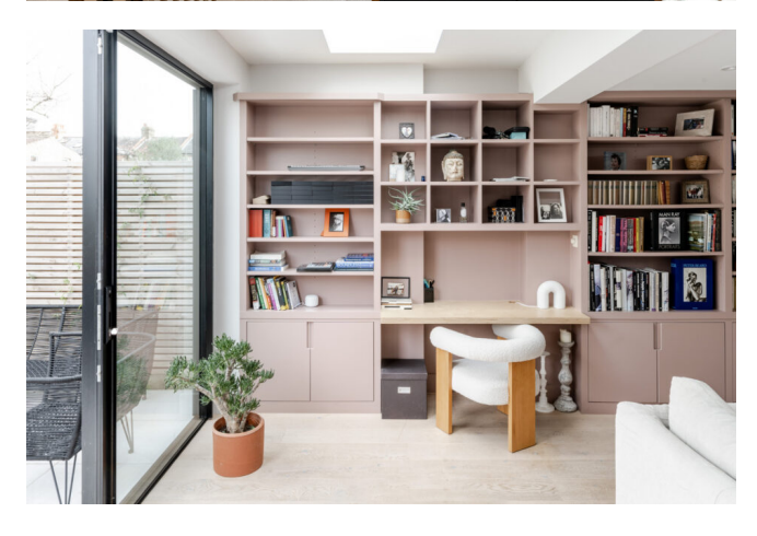
London, South London £1,650,000 Freehold