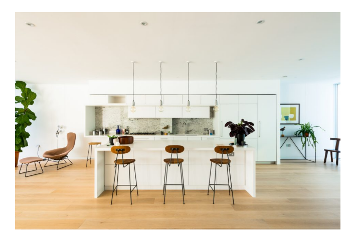
London, North London Sold