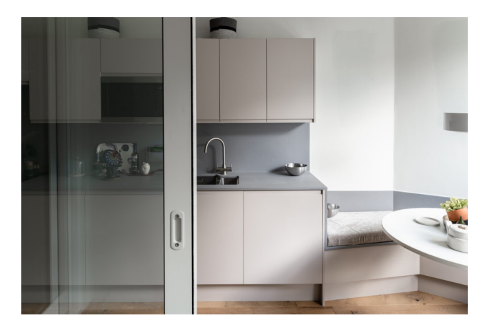
London, North London Sold