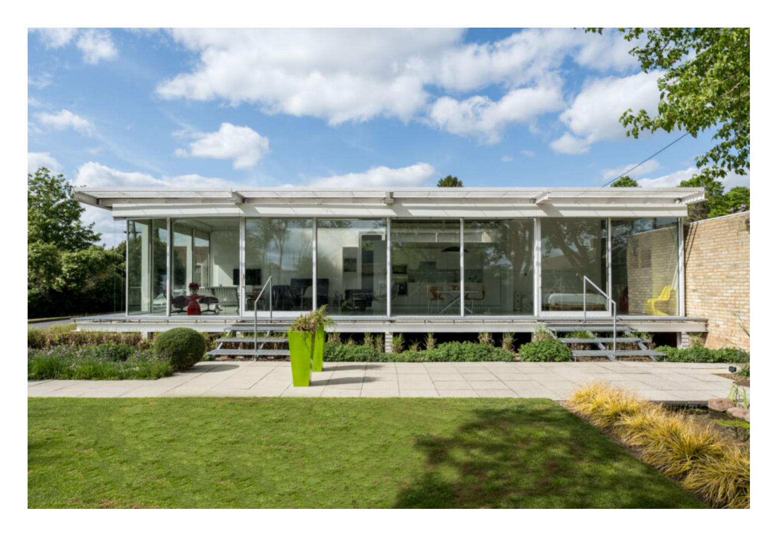
Prickwilllow, Cambridgeshire Sold