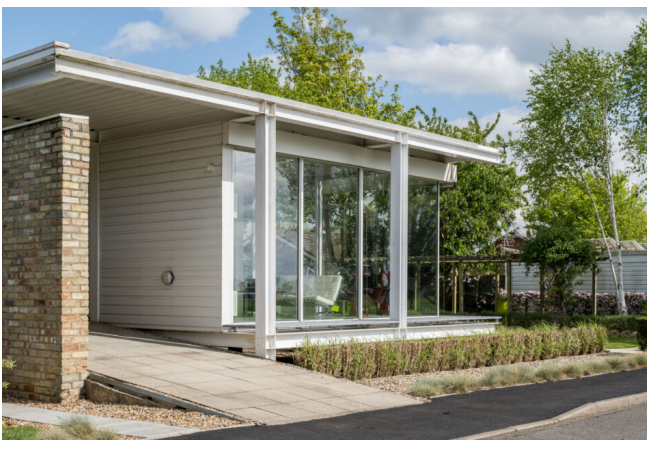
East Anglia Sold