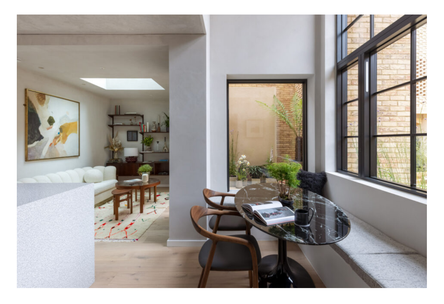
Buller Road, London NW10