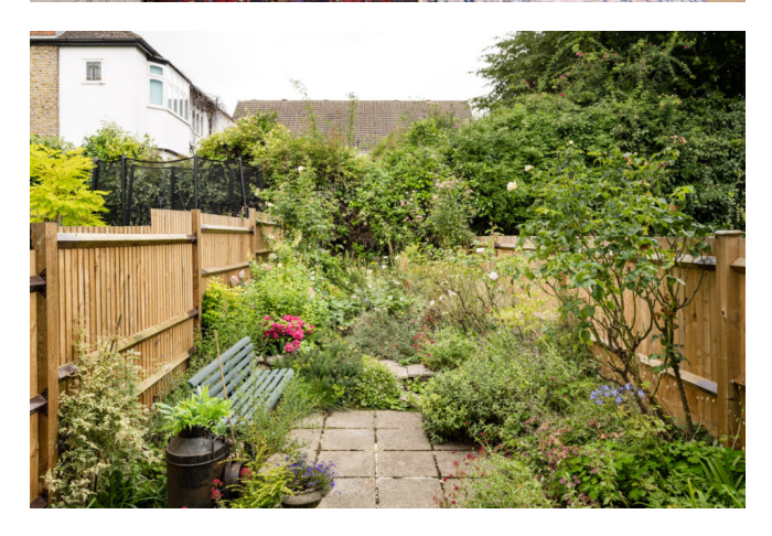
London, South London