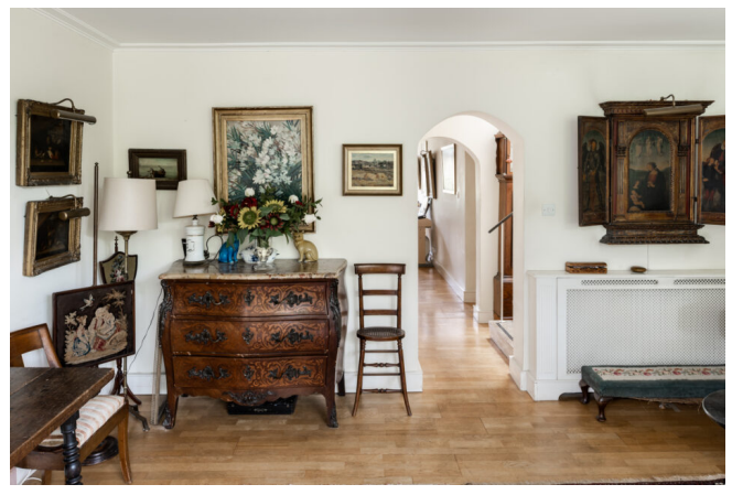
London, South London