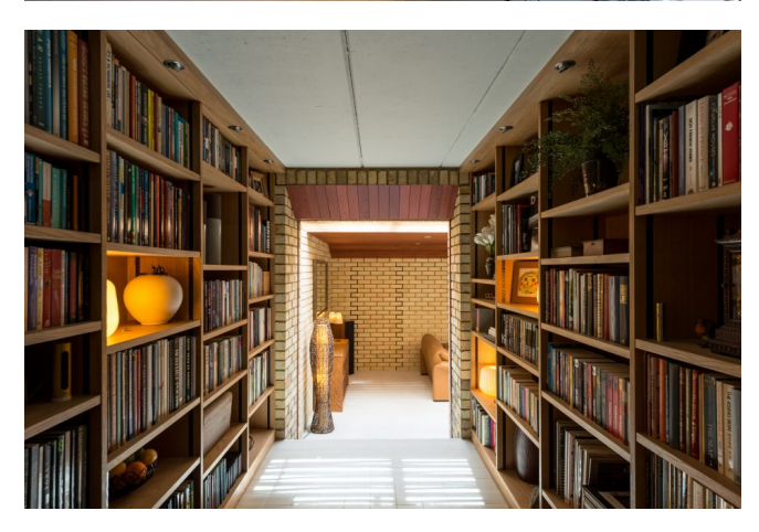
South-East England Sold