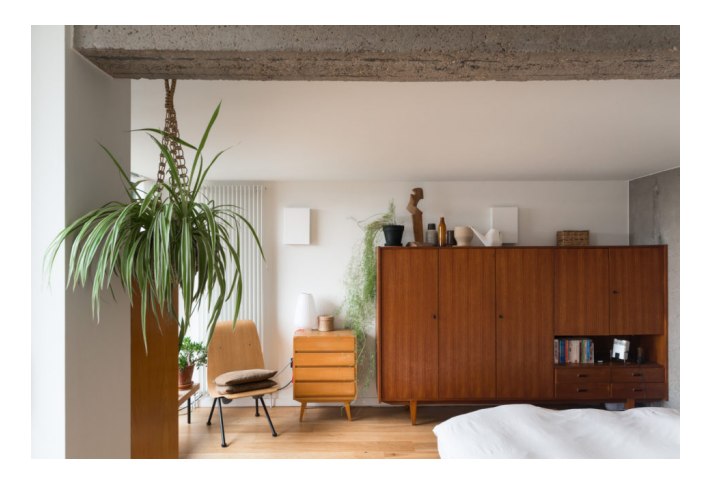
North England Sold