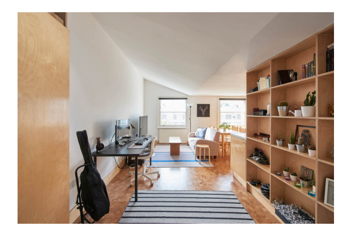
London, North London