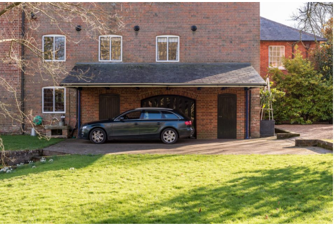
South-East England Sold