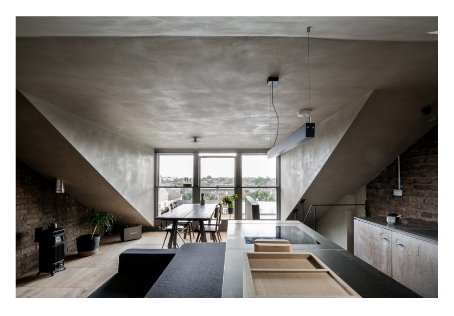
Monnery Road, London N19