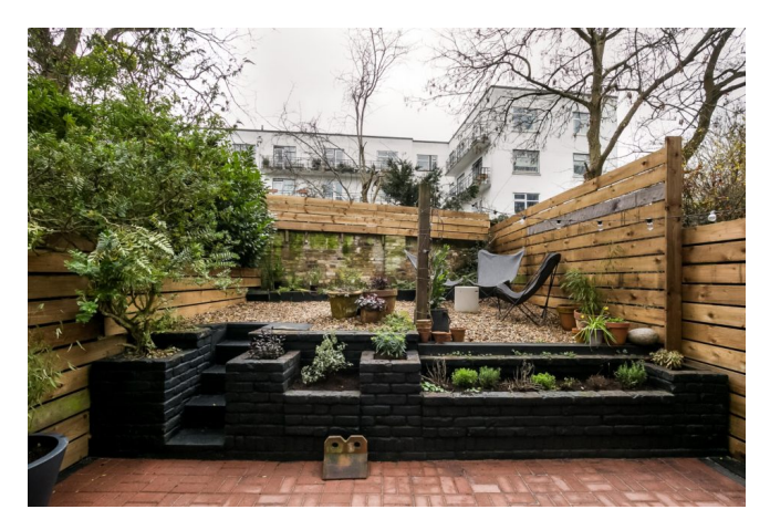
London, South London