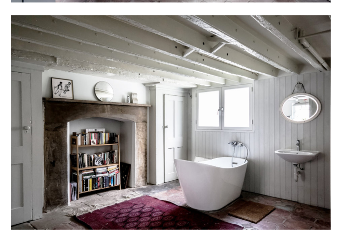
East London, London Sold