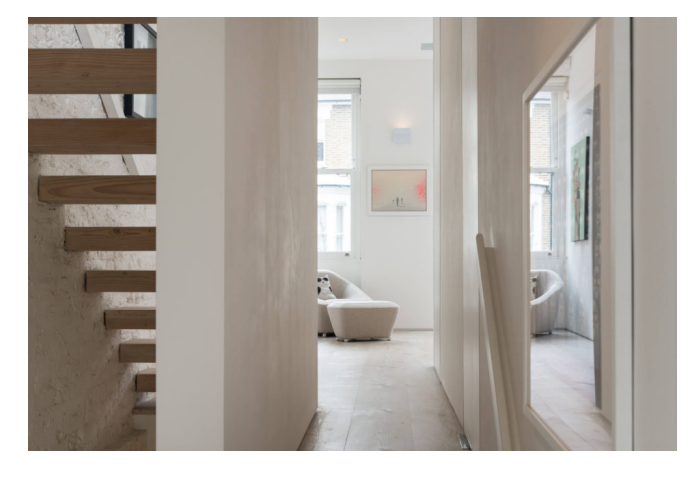
London, North London Sold