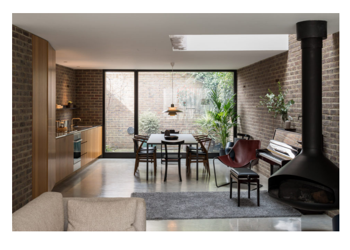
London, South London Sold