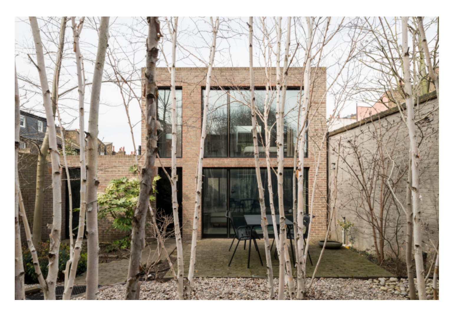
London SE15 Sold