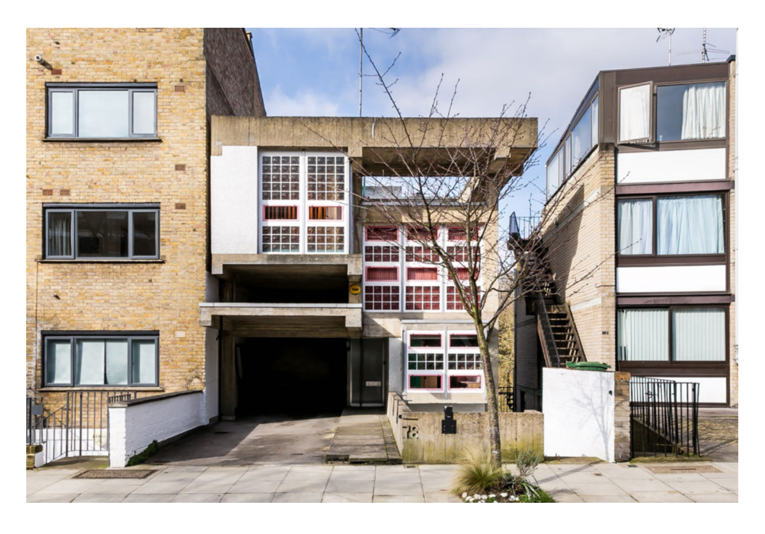
South Hill Park, London NW3 Sold