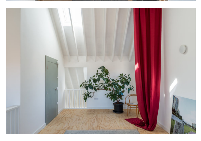
London, South London Sold