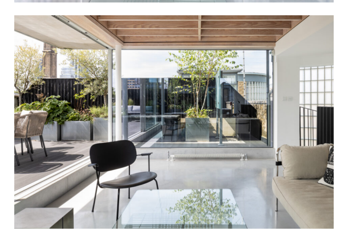
London, North London Sold