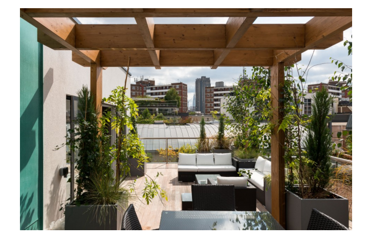
East London, London Sold