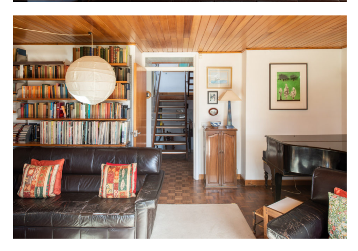
South-East England Sold