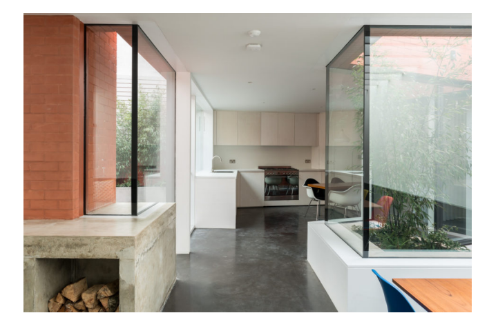
London, South London Sold