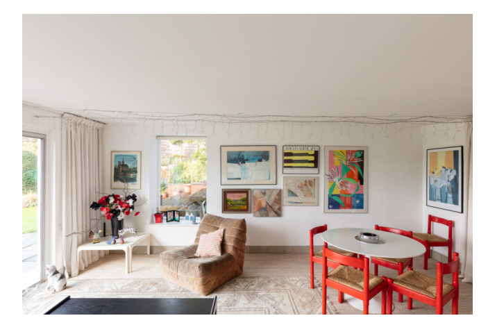
North England Sold