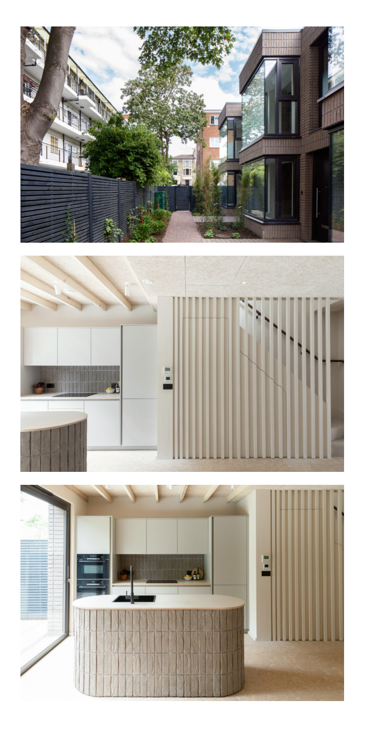
London, North London £1,000,000 Freehold