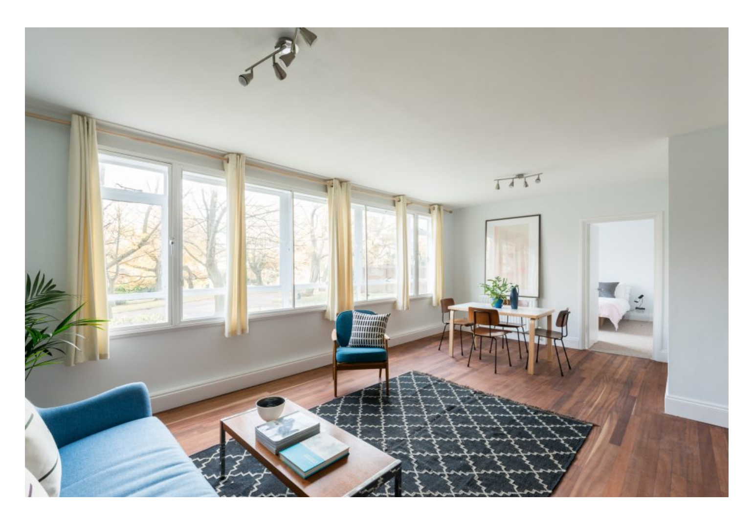
Lymer Avenue, London SE19