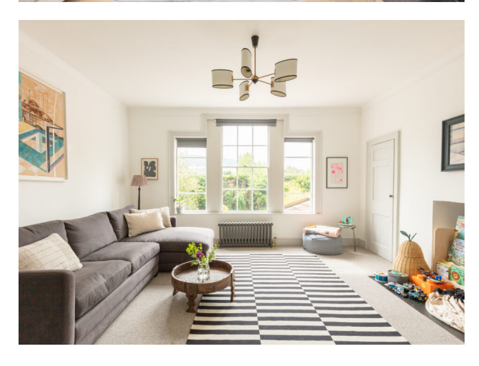
South-West England Sold