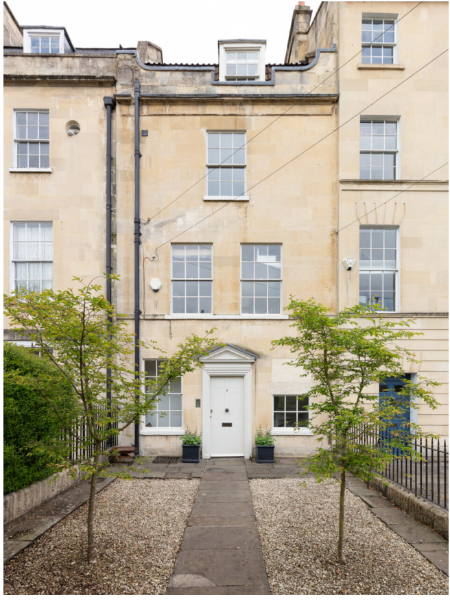
South-West England Sold