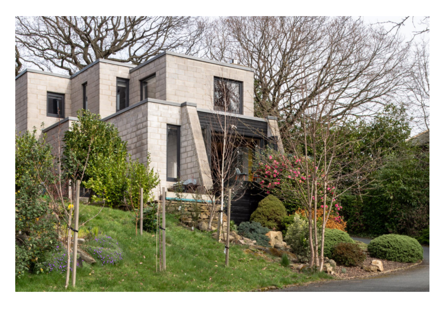
Kirkstall, Leeds Sold