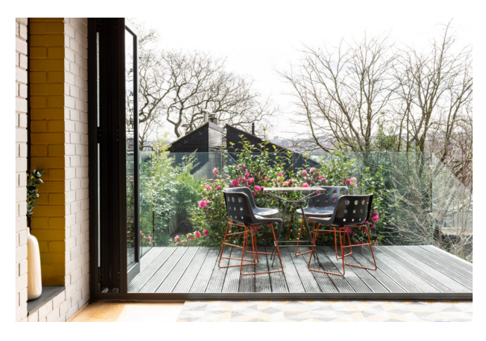
North England Sold