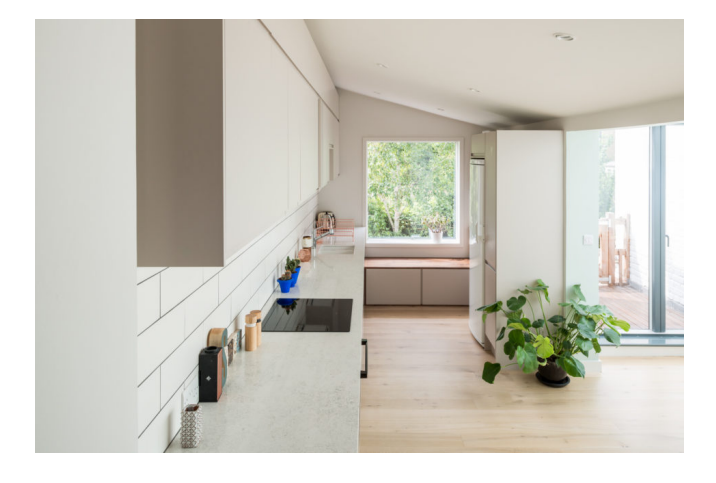
London, North London Sold