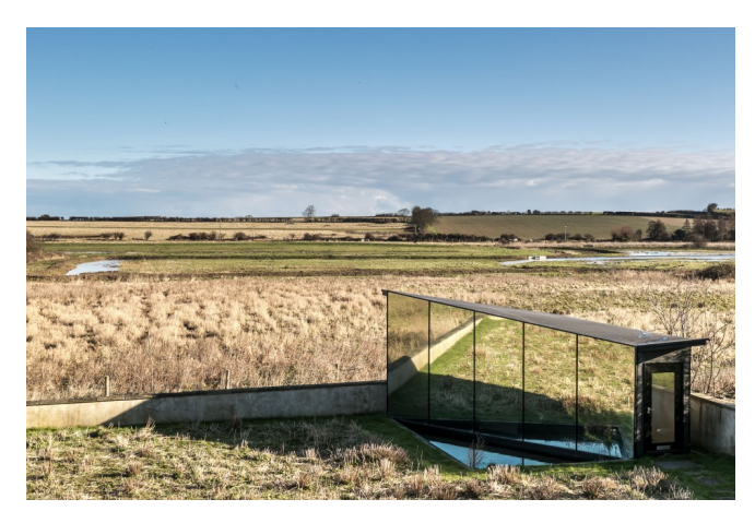
East Anglia Sold