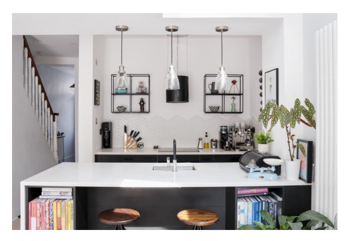
East London, London