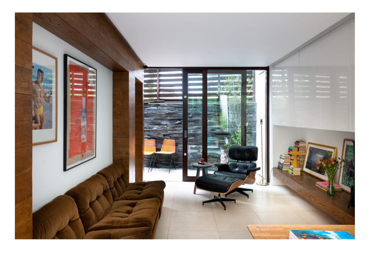
Langford Close, London E8 Sold