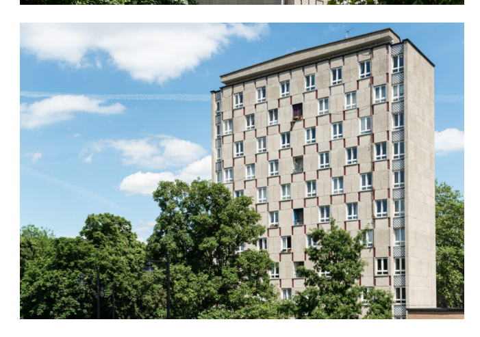
East London, London Sold