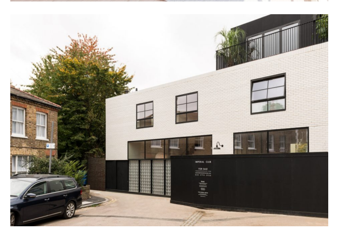
London, South London