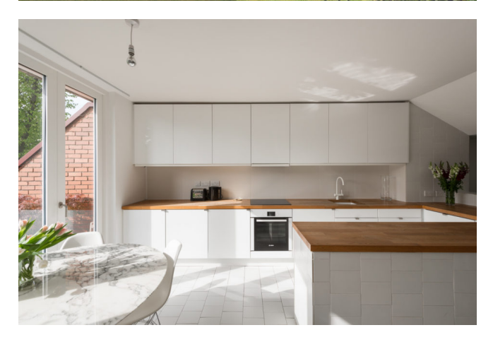
London, North London