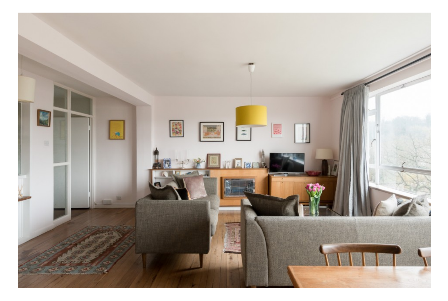
Farquhar Road, London SE19 Sold