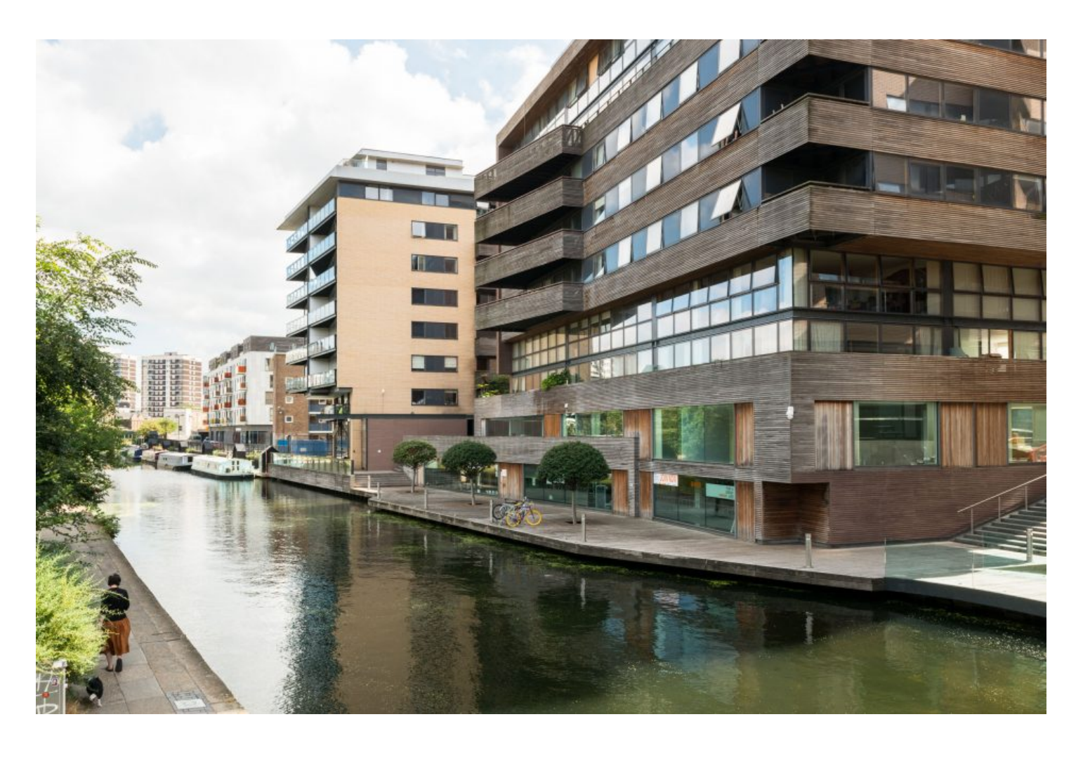
Poole Street, London N1