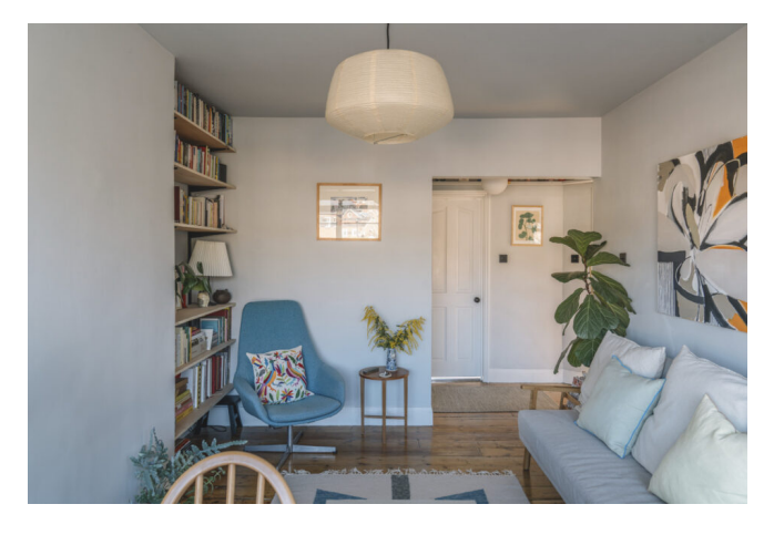
London, South London £455,000 Share of Freehold