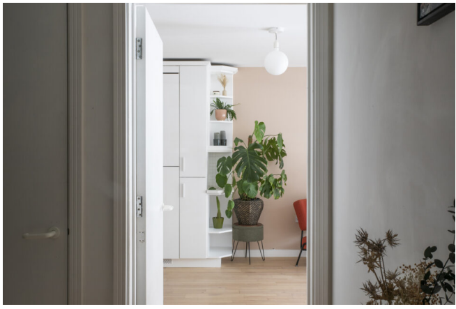
London, North London