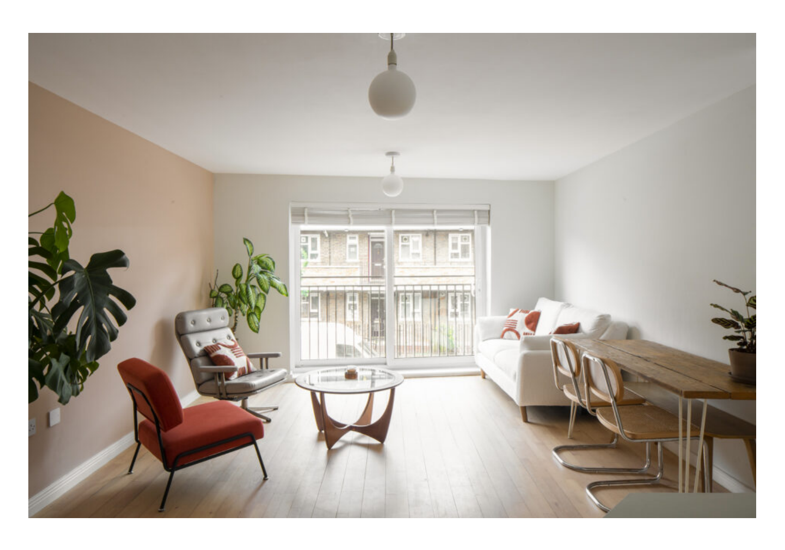
Defoe Road, London N16