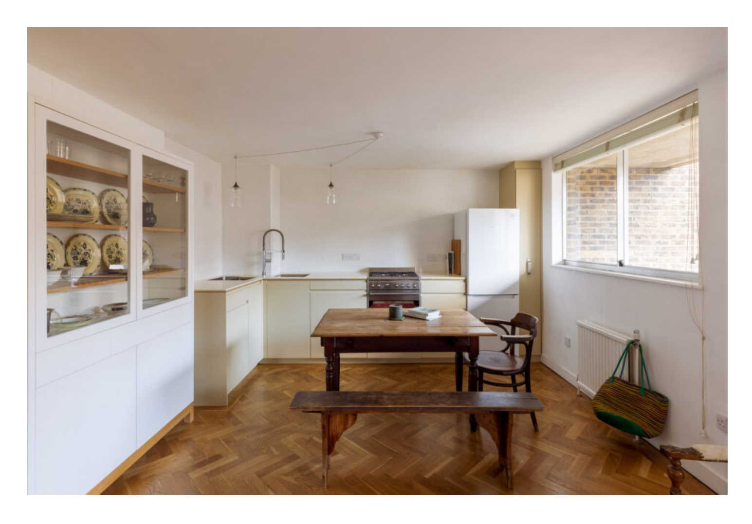
Errol Street, London EC1