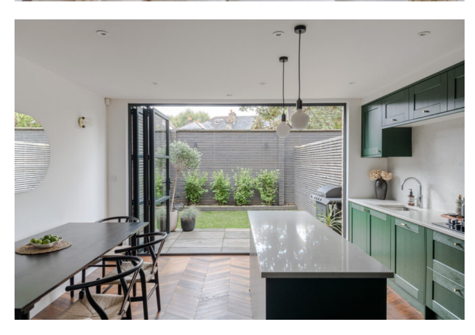
London, South London £1,000,000 Freehold