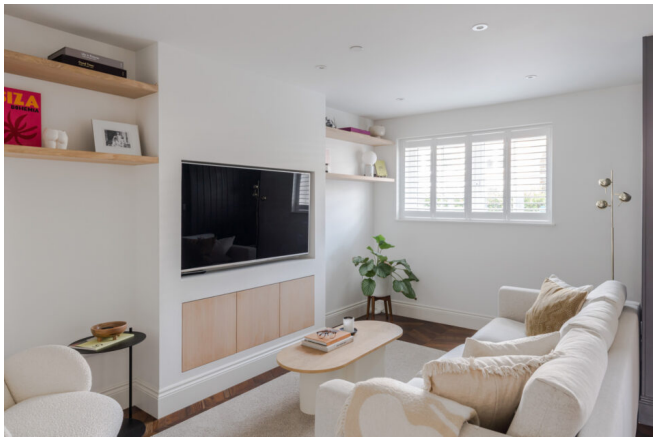
London, South London £1,000,000 Freehold